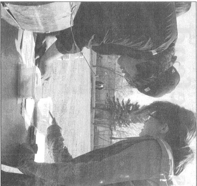
Taking time to analyze crayfish is the task of these two students.

Teams were given the option of registering for just the regional Envirothon, or also trying to compete provincially. One team from Norway House took up torch to represent