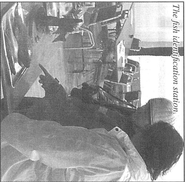
The fish identification station.

Given the weather and the need to rethink the whole event on their feet, the sense of pride – among both the teams and the organizers – at the end of the day was well deserved.