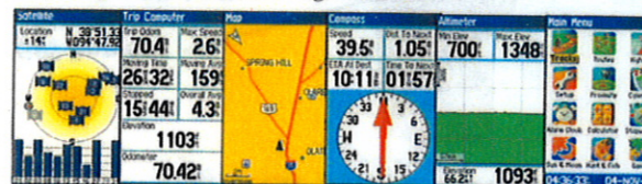
Satellite Page Trip Computer Page Map Page Compass Page Altimeter Page Main Menu

The Main Pages provide the information you need for basic navigation using the GPSMAP 60CSx. Press the PAGE key repeatedly to cycle from one Main Page to another.