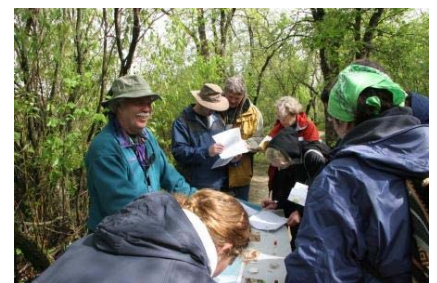
2010 mystery team hard at work