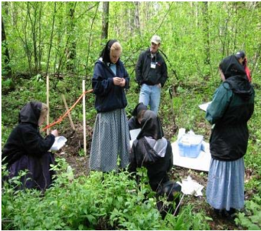
Students at the Duck Mountain Forest Centre

The Regional events will consist of a field test and orals competition. The field test will be comprised of ten stops, some regions will have additional stops to incorporate the oral presentations. There are seven different regional competitions thus the format for each region will differ slightly.