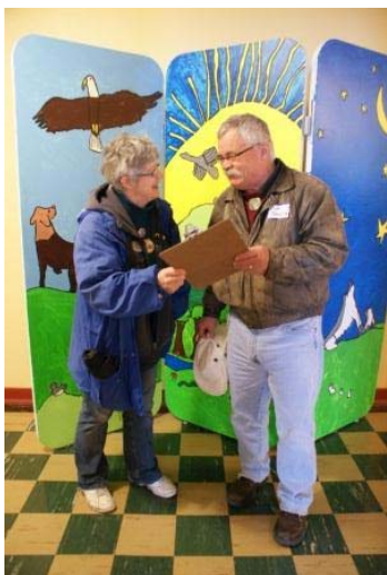
Volunteers at the Pembina Valley Conservation District Regional Event. 2010

http://www.thinktrees.org/Envirothon_Volunteers.aspx