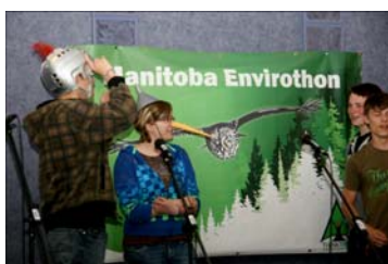
2010 team introductions Brandon Manitoba

After preliminary orals, the top 3 teams will present their orals presentation to a new panel of judges, students, teachers and volunteers. Winners will be announced shortly after, awards and final remarks will wrap up at 5:00pm. Teams will grab their dinner to go.