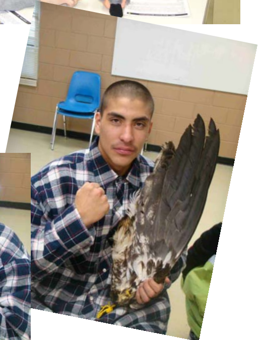
These photos show some of the activities that the students at Frontier School did during the course.