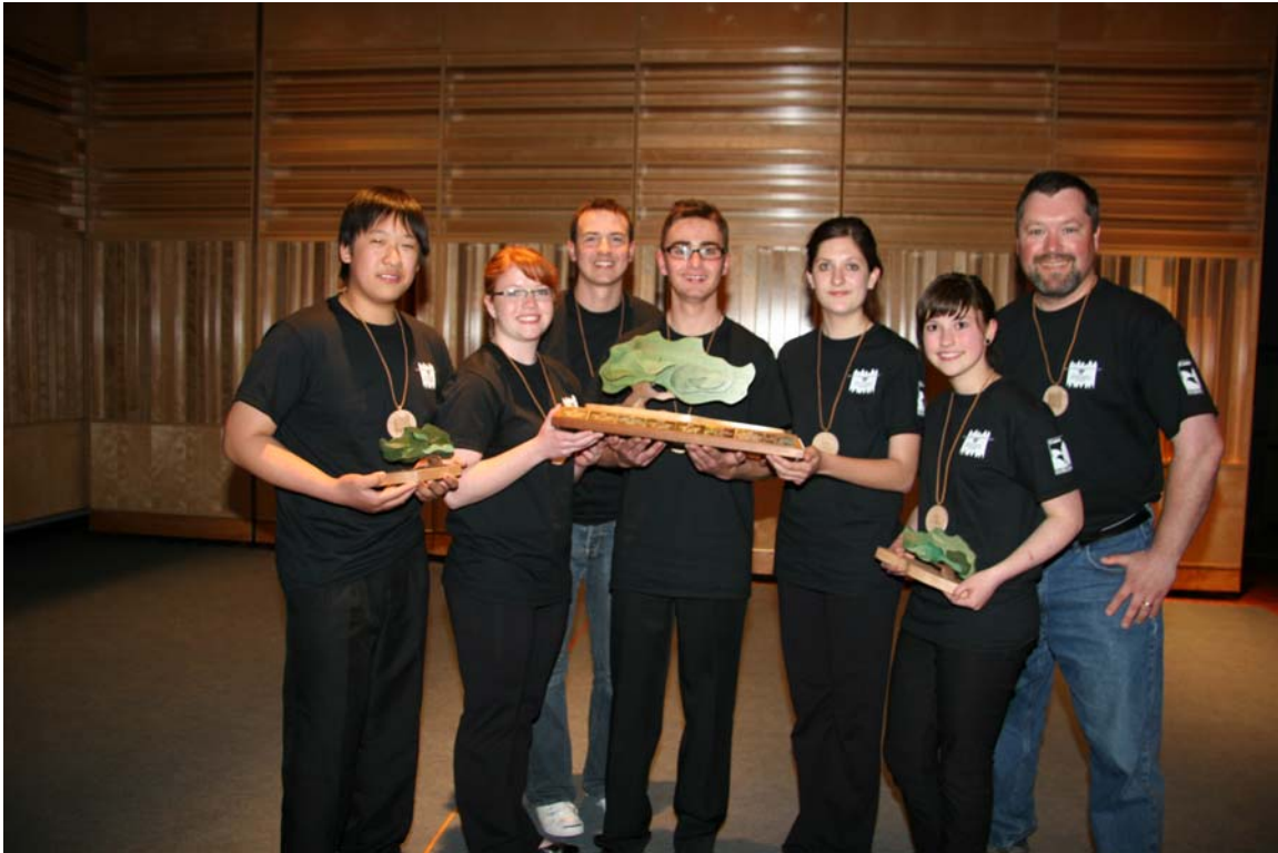
2009 Manitoba Envirothon Winning Team Northwest Soil Management Association (Swan Valley Regional Secondary School)