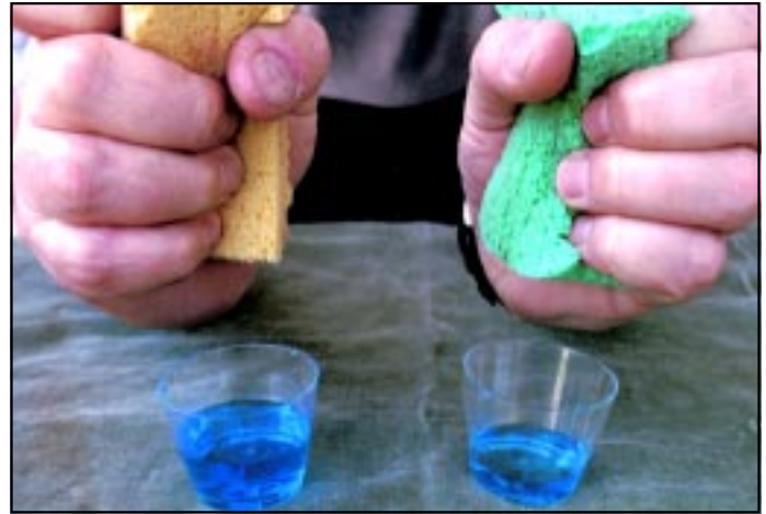
Figure 2: Available water capacity is greater with small pore size.

Soil quality with respect to available water is better for the soil from Maine (ME), because of both the internal properties and the lower evapotranspiration deficit.