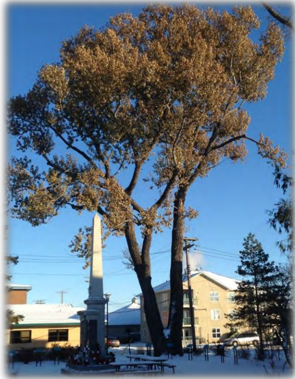
The Morden Cottonwood

MFA staff continue to update the Manitoba Tree Register with all nominations received in person, by fax or through the mail. Staff have also been working on managing the nominations received through previous initiatives and gaining the proper approvals to highlight these trees in the Manitoba Tree Register.